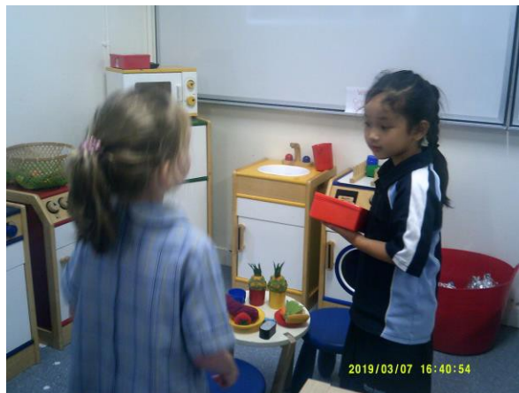
Bootcamp Lunch at a Friend's