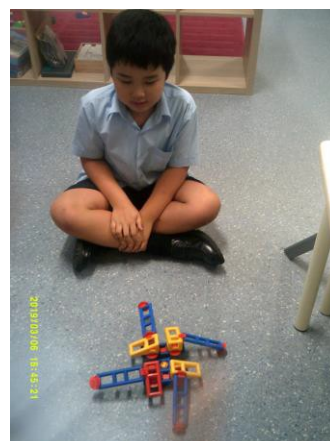
Engineers in the making Mobilo Spinners