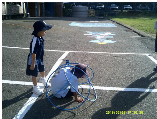
Road and Train Track Construction Hula Hoop Shapes